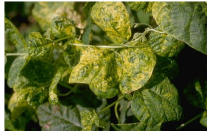
Golden Mosaic Virus (BGYMV)