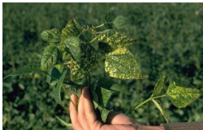
Bean common mosaic virus